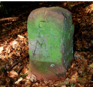
Place of the stone (a)