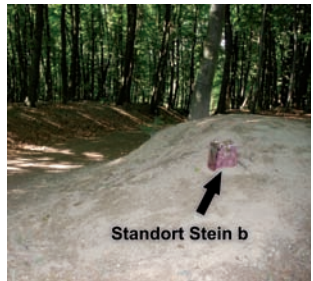
Place of the stone (b)