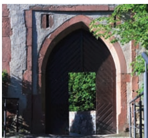
Gate of the gate-tower