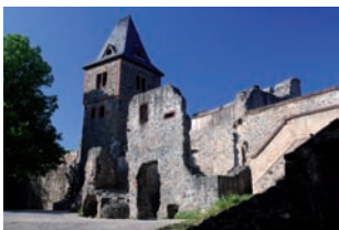
Western side of the core-castle