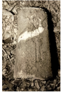
Top of the stone (b)

The boundary stones at the northern wall of the castle chapel (15) date from 1556. Stones remaining from this period are very rare. These stones had to separate the district Seeheim from Frankenstein's territory. Seeheim was under the rule of the Counts of Erbach. At the left stone (a) the sign of the "Hippe" (a former vine knife) can be seen. It is also shown at the northern wall of the old town hall of Seeheim, and it is still today part of Seeheim's emblem. The missing upper part of the right stone (b) was also marked with this sign. 2008 both historic stones were brought up to the castle for protection against vandalism. Originally, they were placed on the border between the municipalities Seeheim-Jugenheim and Muehlthal (territories Malchen and Nieder Beerbach). Boundary stones showing Frankenstein's coat of arms were found in Ockstadt, Frankfurt and Buerstadt, but not near the castle. It is quite possible that they had been taken away by the Landgraf of Hessen-Darmstadt 1662.