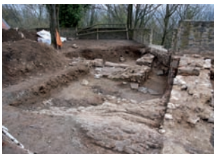
Excavation at the eastern side of the core-castle