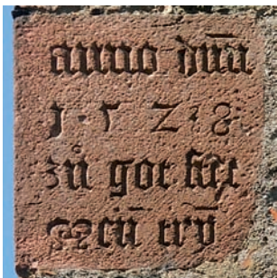
Family's motto at the inner tower