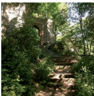
Picturesque small sally gate