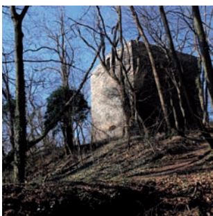
Outer tower with ramparts