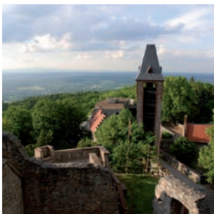
View from the core-castle to the north

The core-castle is the oldest area of the site and dates partly from the time of foundation. It was surrounded by a 2 yards thick polygonal curtain wall (1). Buildings leaned closely thronged against it. The quarrystone work had a roughcast.