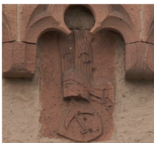
Armorial plate with tracery frieze